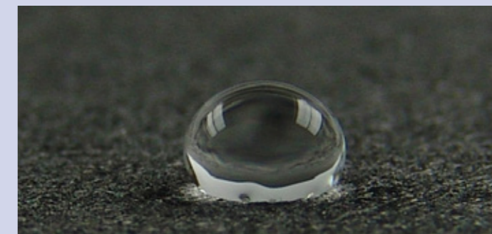
Surface of a Freudenberg GDL

Freudenberg's production process is fully integrated, from the fibrous raw material to the final product, guaranteeing consistent quality and performance. To ensure that our products meet the highest quality requirements, statistical process controls, fully automated camera-assisted inspections, in-line and off-site measurements are all standard procedures. Depending on the needs of our customers, we also offer a range of special GDL characterization methods either on request or for joint development projects. Regular internal and customer audits confirm the quality of our GDLS.