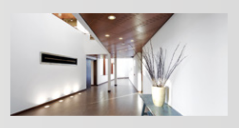
Wooden ceiling, hotel, Chile